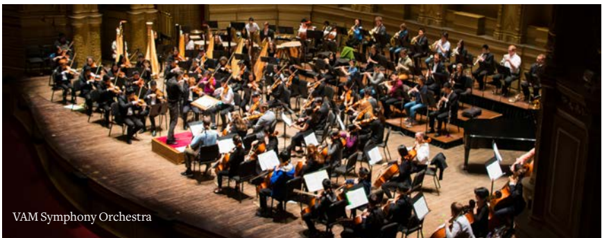
VAM Symphony Orchestra

Preparation and public performance of representative works from the symphonic literature. All instrumental students must be enrolled in the orchestra program. VAM Symphony Orchestra gives four concerts each year.