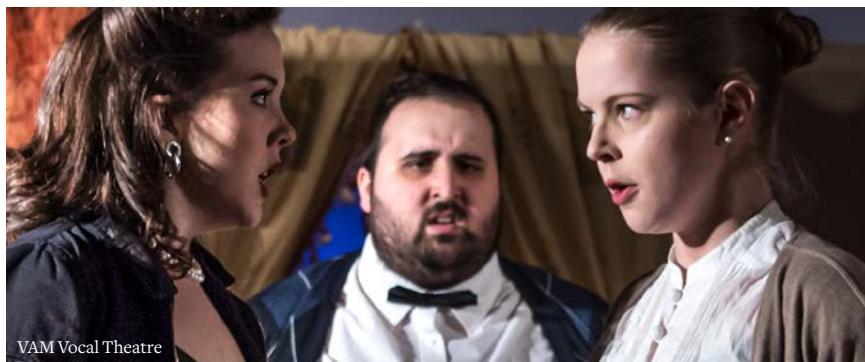
VAM Vocal Theatre