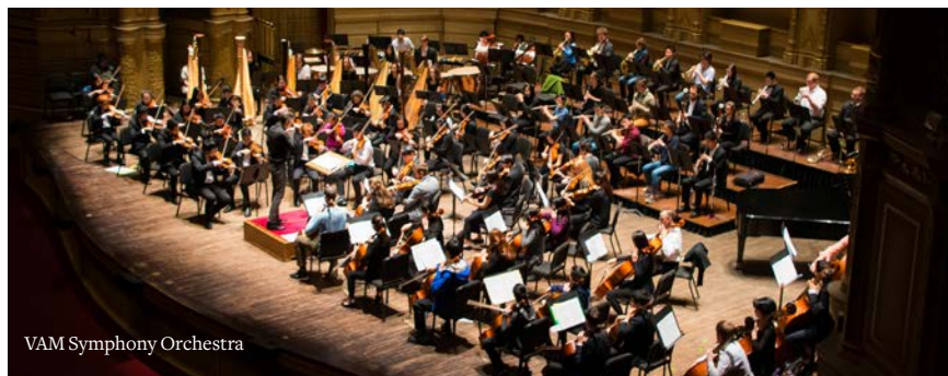
VAM Symphony Orchestra

Preparation and public performance of representative works from the symphonic literature. All instrumental students must be enrolled in the orchestra program. VAM Symphony Orchestra gives four concerts each year.